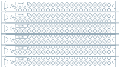
VIRTUAL PROTECTION GROUP (vPG)